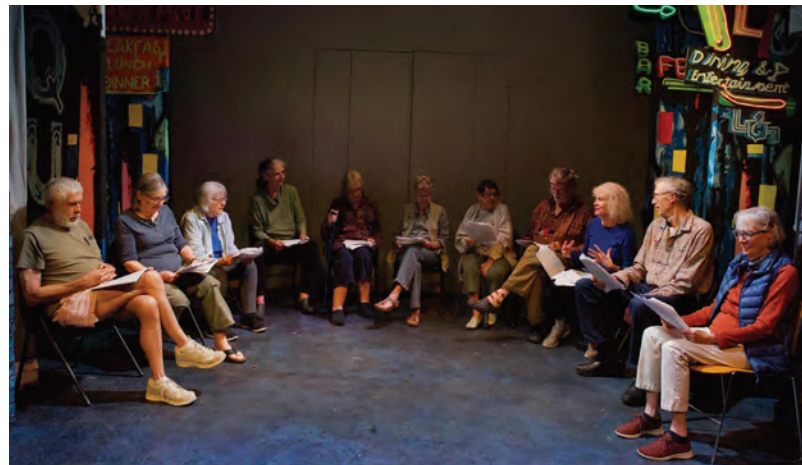
A rehearsal session of Seniors from the Philipstown Aging at Home Acting Program