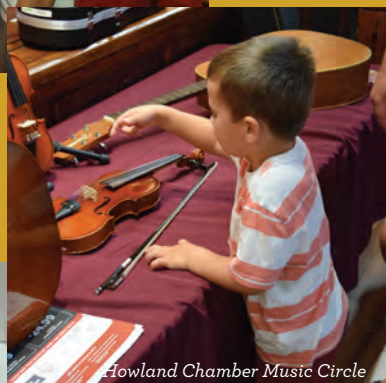
Howland Chamber Music Circle