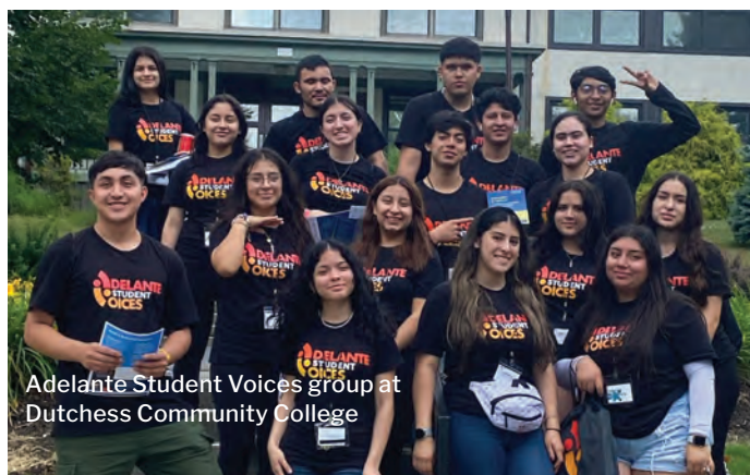
Adelante Student Voices group at Dutchess Community College