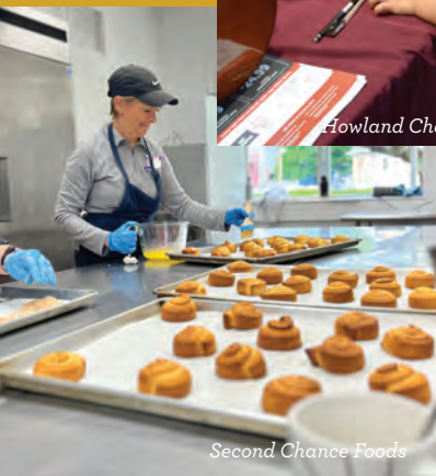
Second Chance Foods