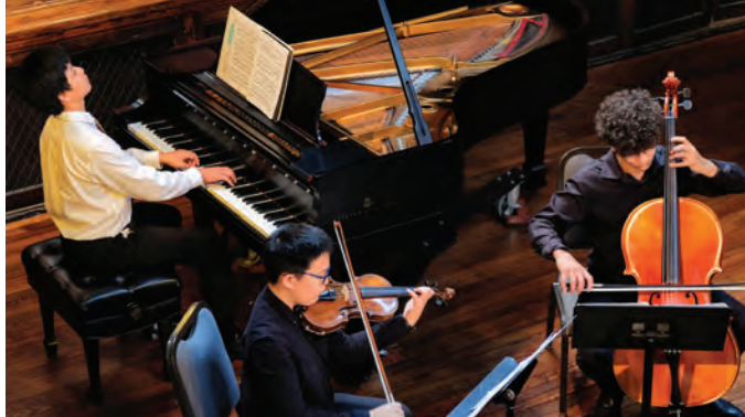
Lyra Young Artists Trio at Howland Cultural Center