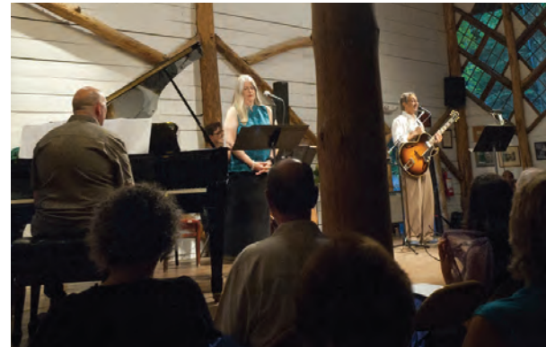
Maverick concert.