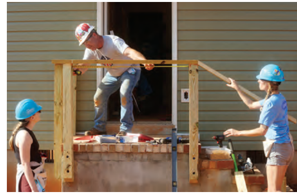
Habitat volunteers building a new home.