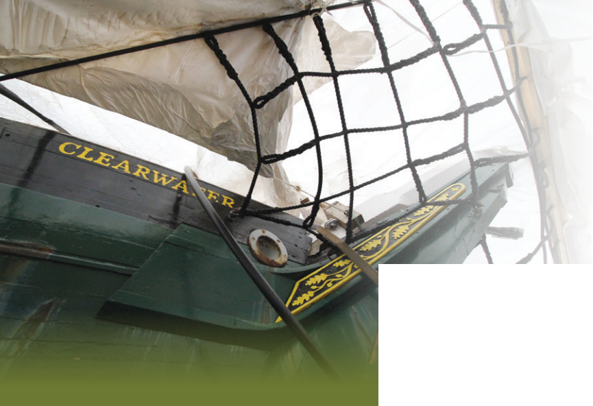
Hudson River Sloop Clearwater