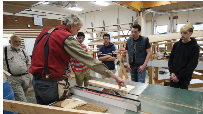
Hudson River Maritime Museum