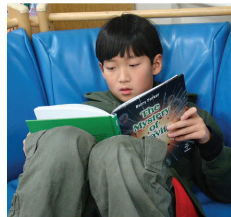
East Fishkill Community Library