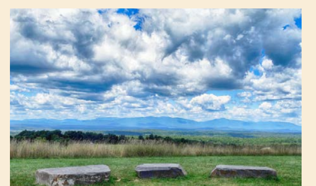
Winnakee Land Trust

As always, we are thankful for ALL of our partners – donors, businesses, professional advisors, individuals, as well as nonprofits, schools and government. Together, we continue to improve the quality of life for all who live and work in our region. Thank you again for all that you do.