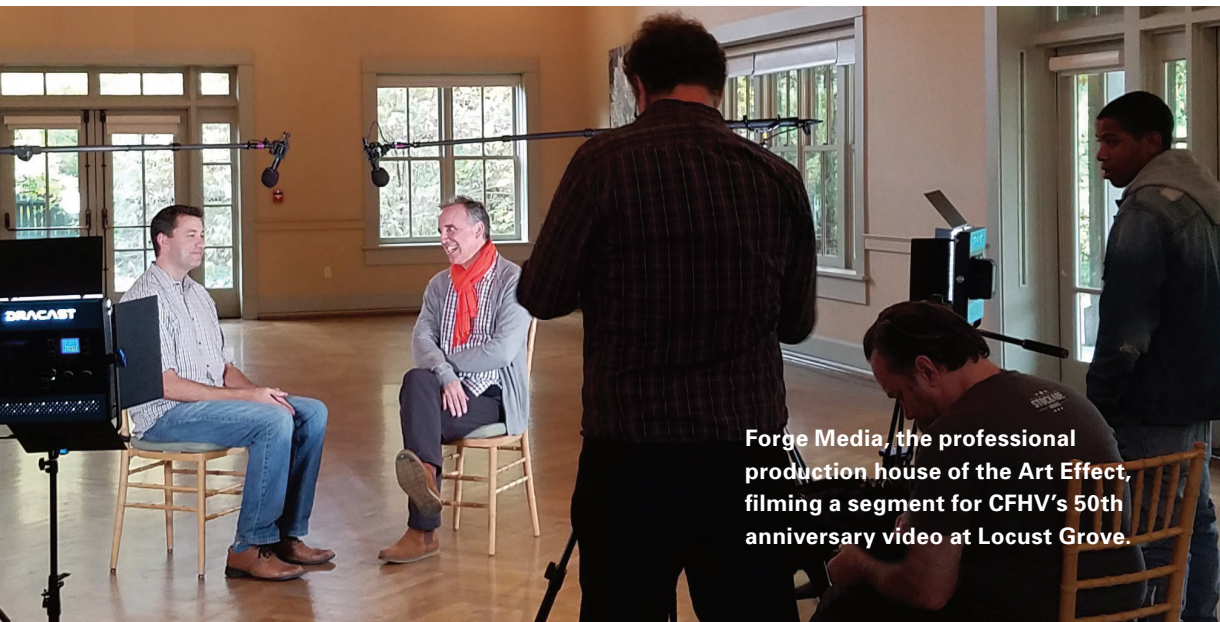
Forge Media, the professional production house of the Art Effect, filming a segment for CFHV's 50th anniversary video at Locust Grove.