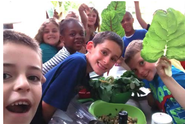
Hudson Valley Seed