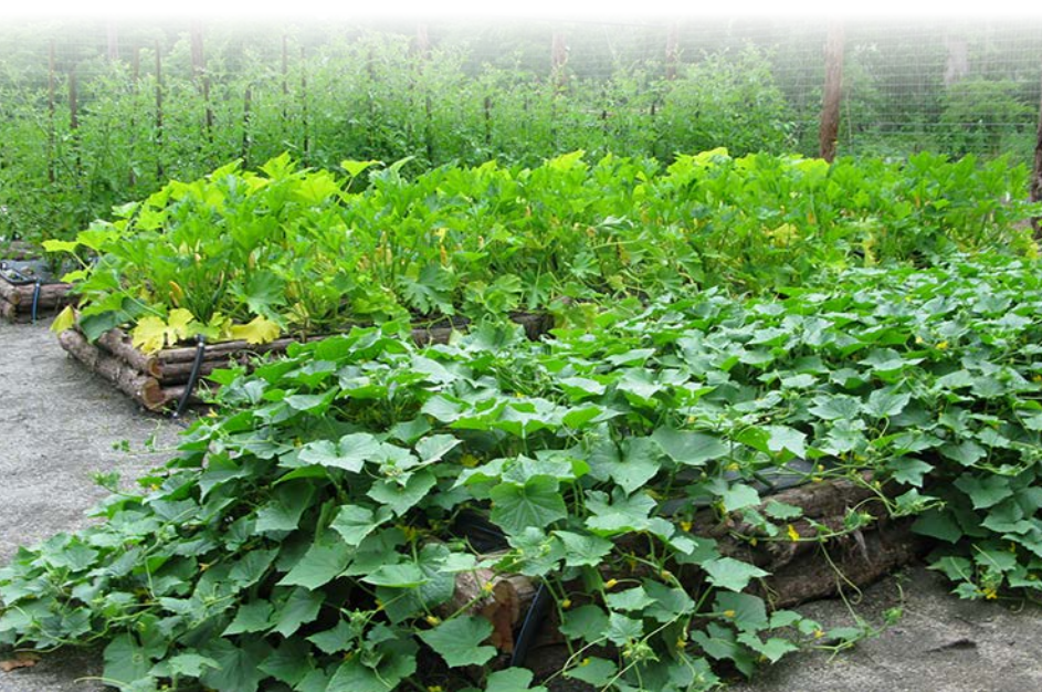
St. Thomas Episcopal Church, Amenia