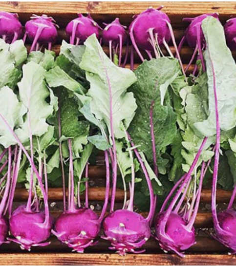
Poughkeepsie Farm Project

With such bounty in our midst, and a variety of media bursting with recipes, cooking shows and other "foodie" content, the concept of food insecurity in