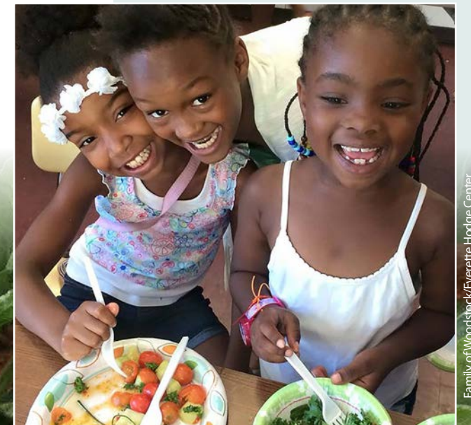
Family of Woodstock/Everette Hodge Center