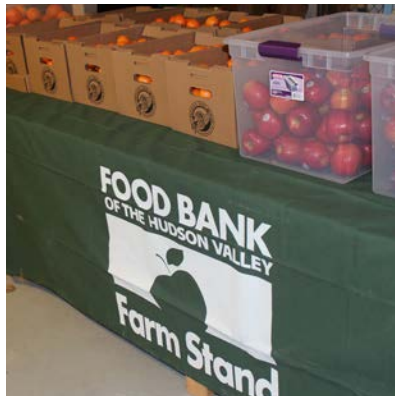
Cornerstone Family Healthcare