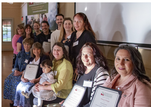
2023 Partnership In Education Award Recipients

For 38 years, generous donors, through 19 permanently endowed funds, have pooled their support for area teachers through the Partnership in Education (PIE) program of the Community Foundations of the Hudson Valley. Through PIE's grant opportunities — The Fund for Excellence in Education and The Nuvance Taconic IPA Science Education Grants — local teachers at parochial, private, and public schools in Dutchess, Ulster, Putnam and Orange counties, can apply for funding that supports their innovative ideas to improve educational outcomes in their classrooms.