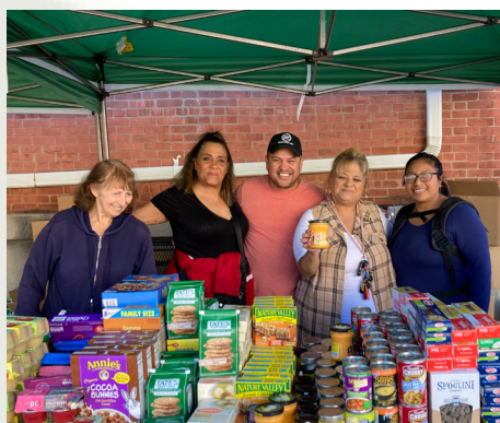
Fareground Community Kitchen