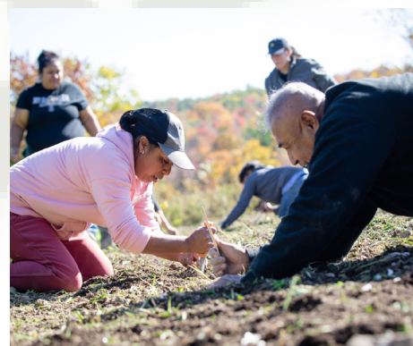
Columbia County Sanctuary Movement