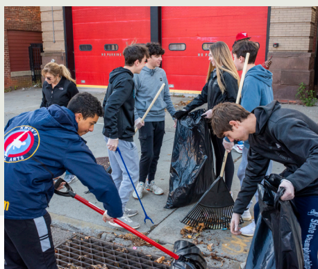
Community Matters 2 Inc.

Our pooled assets — your funds — continue to grow past the $100 million mark. Can you imagine what your funds could do in Dutchess, Ulster, and Putnam counties if our assets doubled in the next five years? YOU — donors, professional advisors, nonprofit and community leaders, organizational board members — are our integral partners in this work. Your philanthropic gifts, your recommendations, your trust, your endowments, and your input are essential to our work to inspire and celebrate philanthropic giving in our communities. Thank you for continuing to “give where you live” and allowing us to be part of your philanthropic plans. There is a massive transfer of baby boomer wealth happening right here and right now, and we so appreciate the trust you continue to place with all of us here at the Community Foundations to work with you to realize your philanthropy and keep your legacy local for the benefit of all. Please call us at 845-452-3077 if we can be of assistance to you.