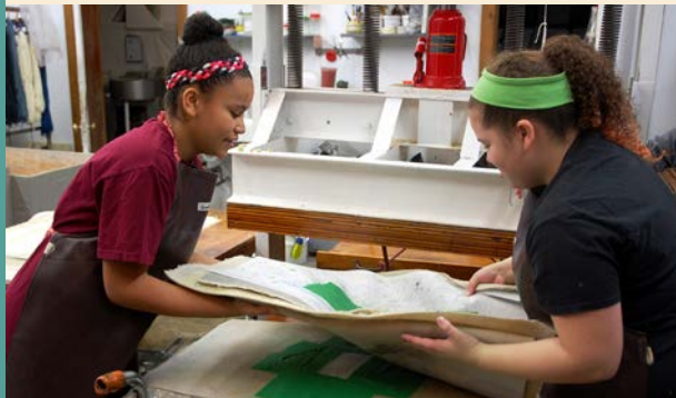
Women's Studio Workshop