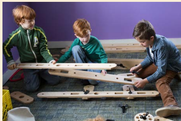
Mid-Hudson Children's Museum